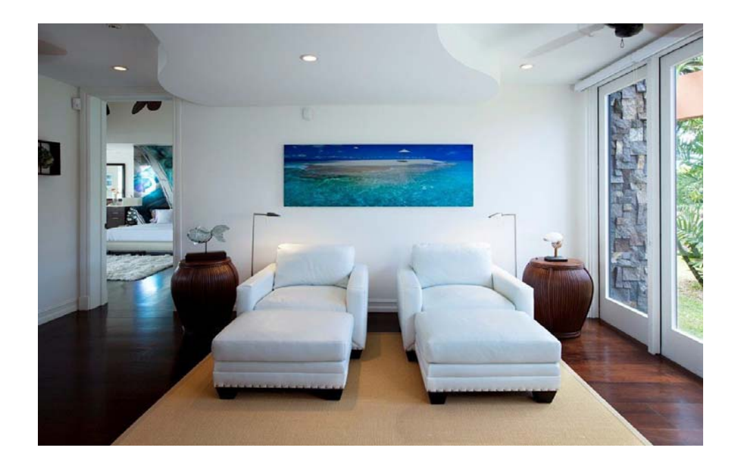
The villa design and size provide more than ample room to entertain, allowing you the pleasure of enjoying your guests' company and indulging with them in what this magnificent property has to offer.